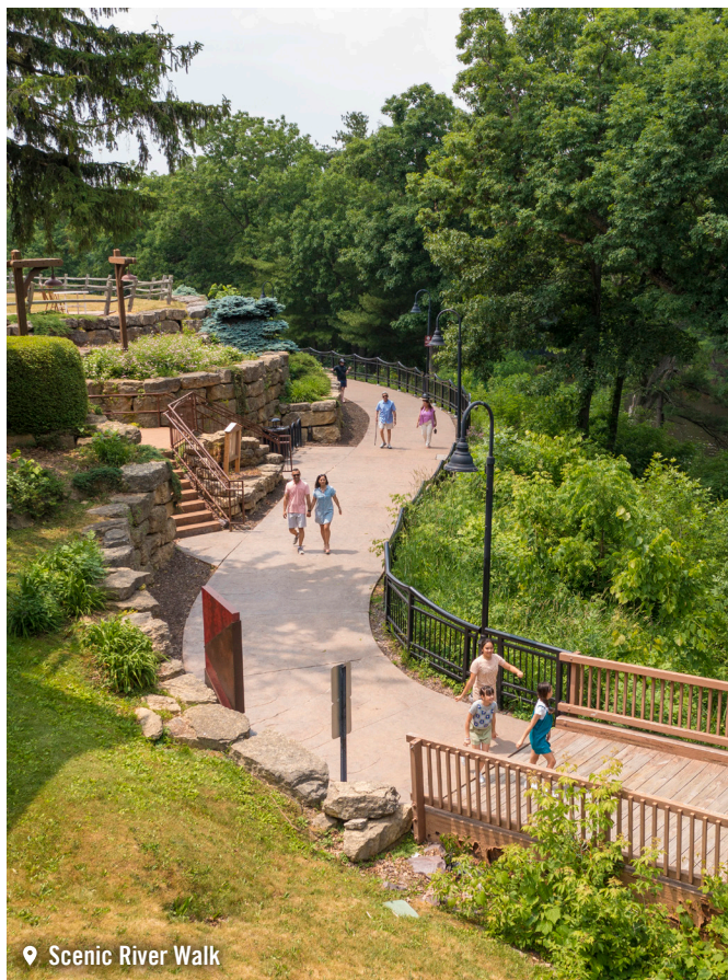
📍 Scenic River Walk