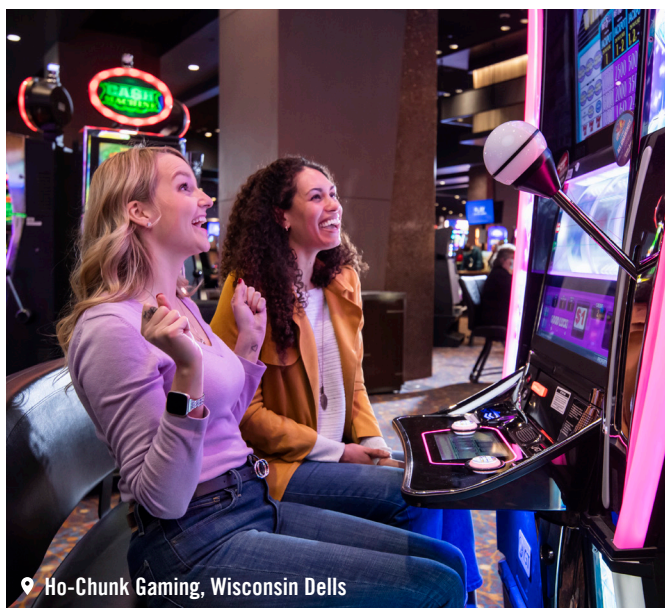
📍 Ho-Chunk Gaming, Wisconsin Dells