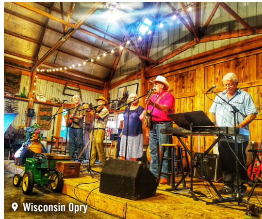
📍 Wisconsin Opry