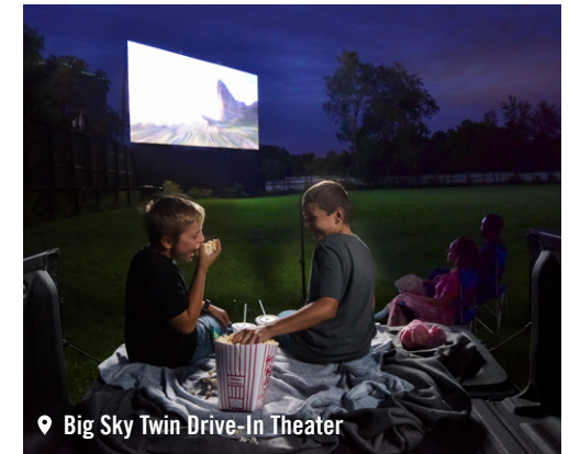
Big Sky Twin Drive-In Theater

Big Sky has 2 big screens, 4 big shows every night of the week, rain or shine. Double-features nightly, with snack bar.