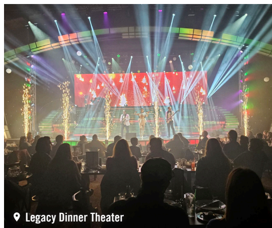
Legacy Dinner Theater