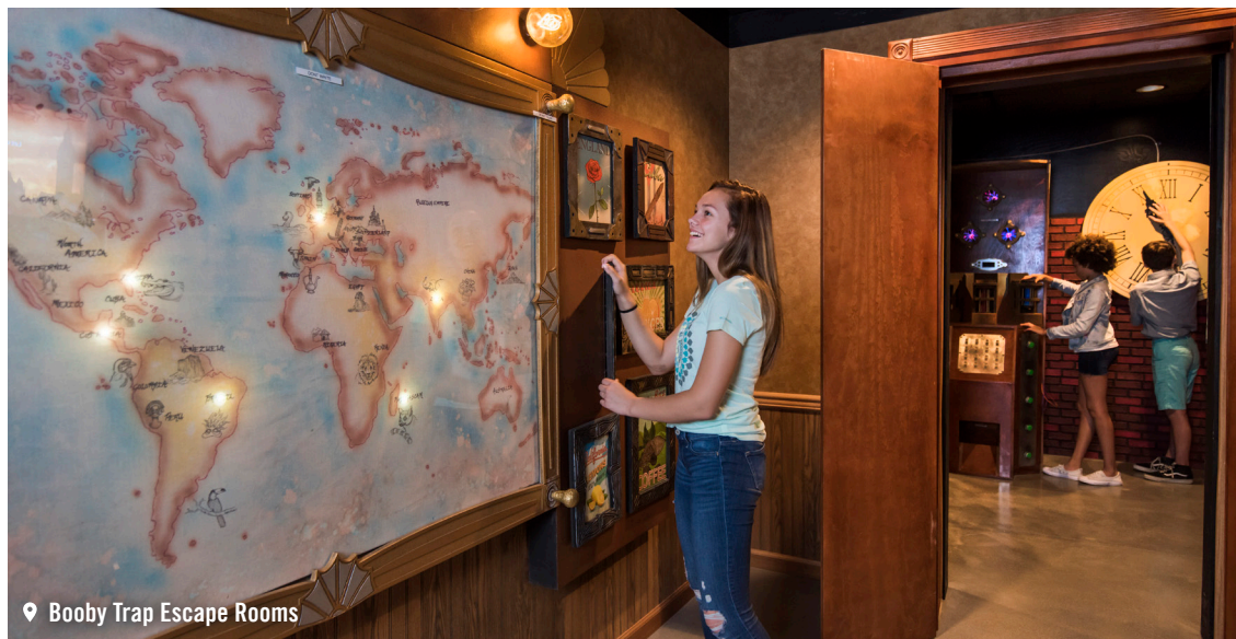
Booby Trap Escape Rooms