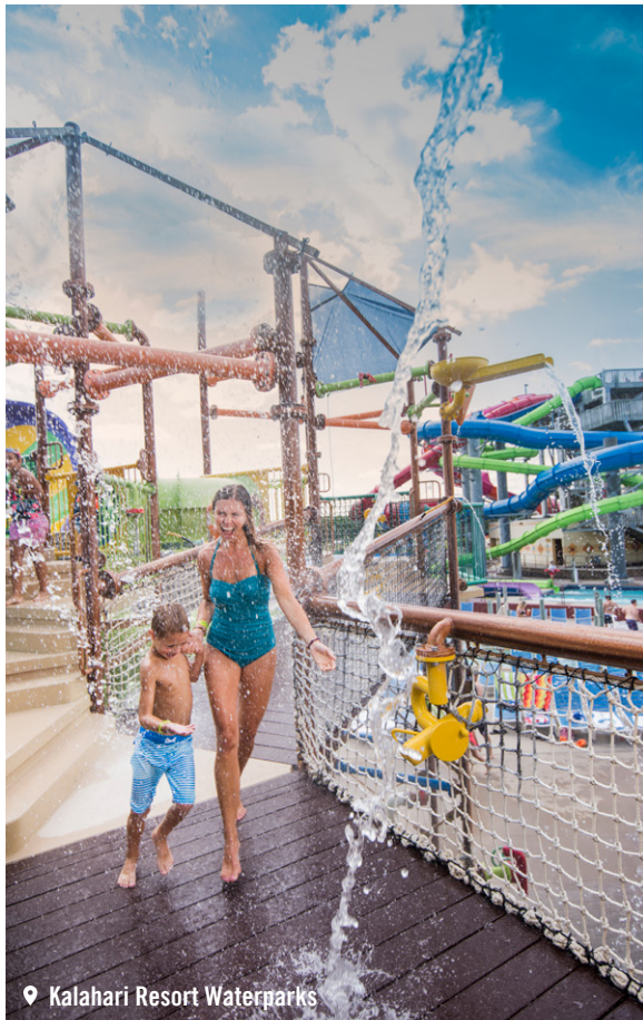
📍 Kalahari Resort Waterparks