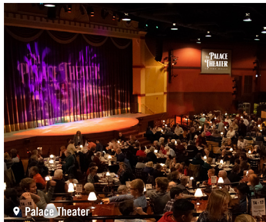
📍 Palace Theater