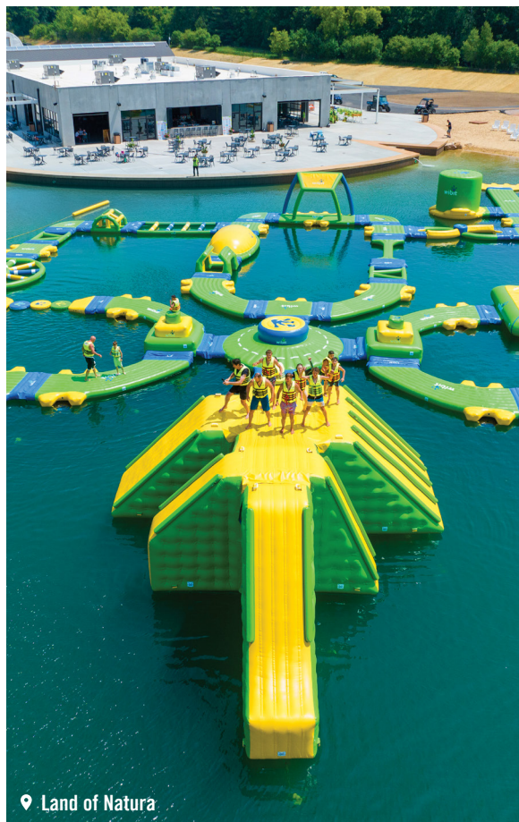
Land of Natura