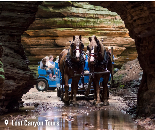
📍 Lost Canyon Tours