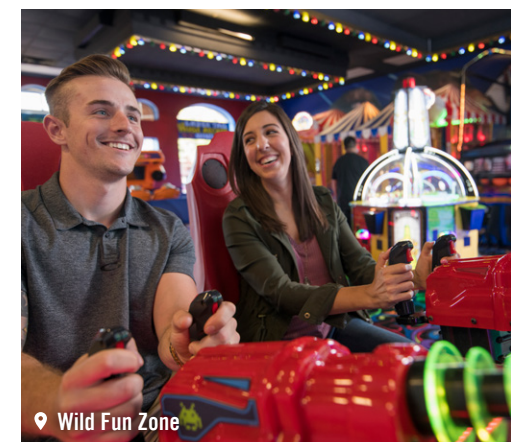
Wild Fun Zone