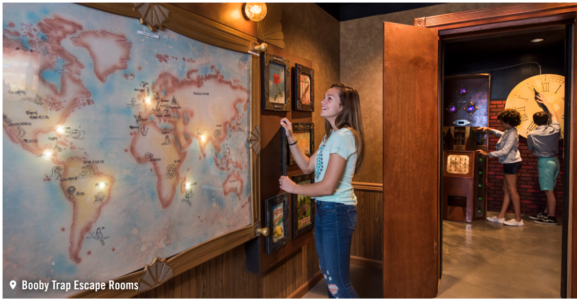
📍 Booby Trap Escape Rooms