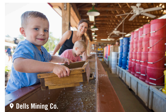
Dells Mining Co.