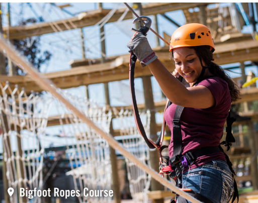
📍 Bigfoot Ropes Course