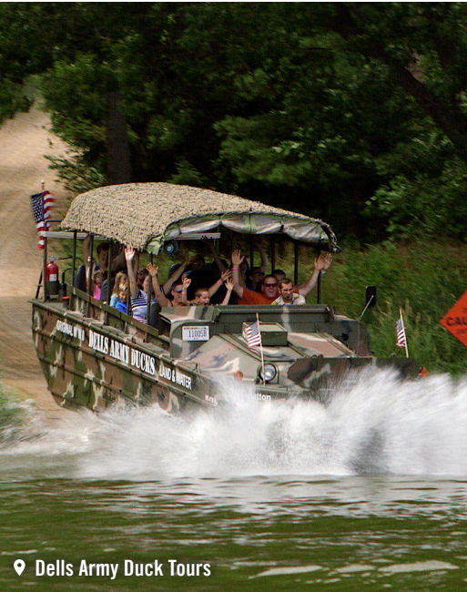
📍 Dells Army Duck Tours