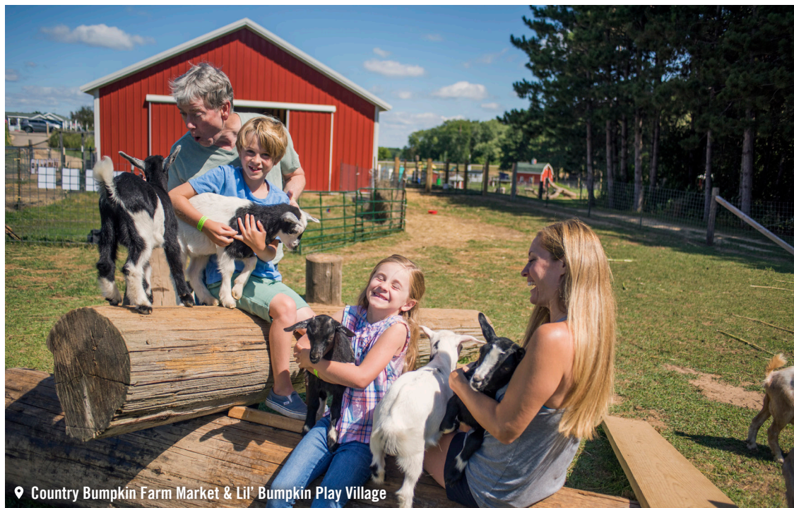
Country Bumpkin Farm Market & Lil' Bumpkin Play Village