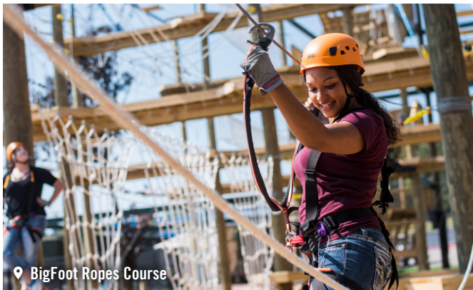
BigFoot Ropes Course