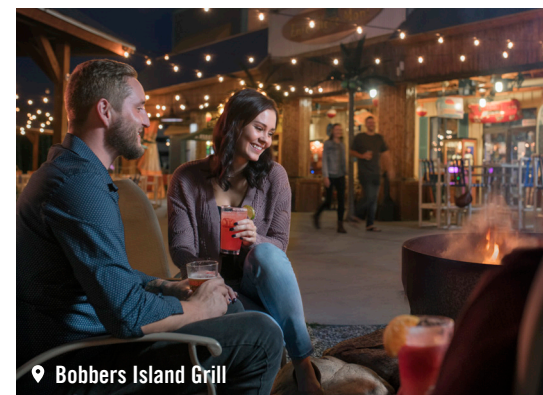
Bobbers Island Grill