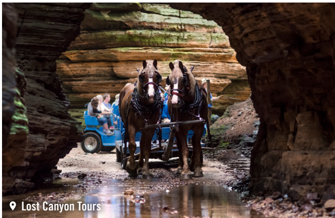
Lost Canyon Tours