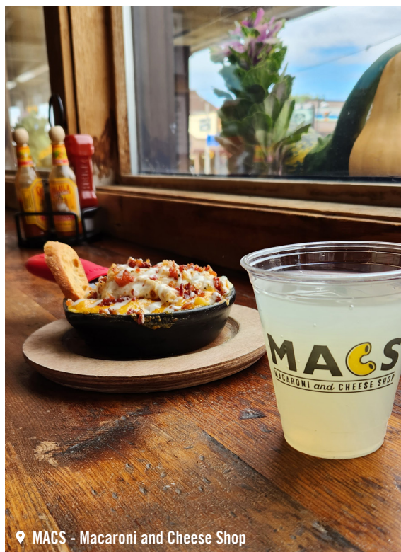
MACS - Macaroni and Cheese Shop