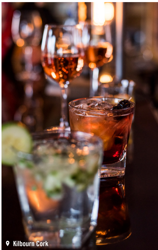
📍 Kilbourn Cork

Whether you are catching a sunset, local band or an after-dinner drink, the fun doesn't end when the sun goes down. The District is an outdoor entertainment space with some of the best sunsets in the area and stunning river views. Kilbourn Cork is a “must-stop” new premium wine bar. Showboat Saloon is locals favorite place for cocktails and entertainment.