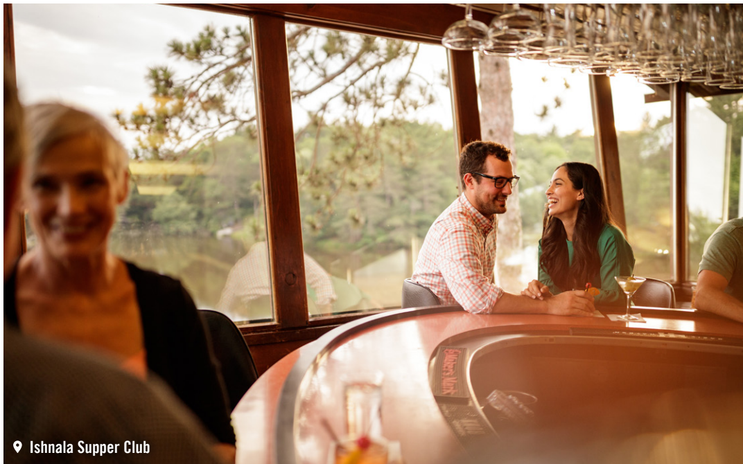
📍 Ishnala Supper Club