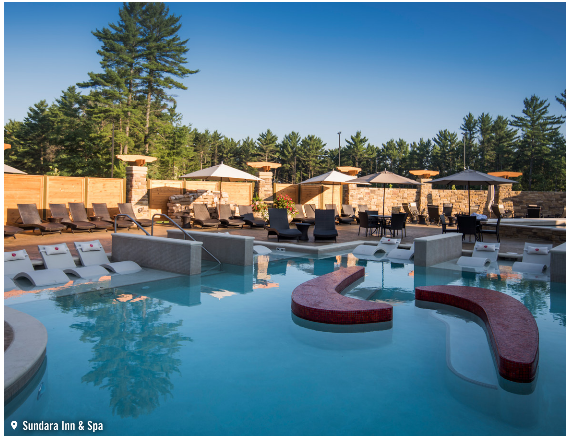
📍 Sundara Inn & Spa

Redd's Piano Bar & Lounge offers nightly entertainment from a host of talented international performers. Sit at the piano, sing along and be part of the show or sit back, relax with a great hand-crafted cocktail.