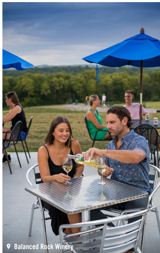
📍 Balanced Rock Winery