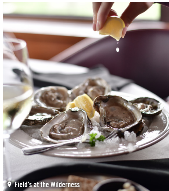
📍 Field's at the Wilderness